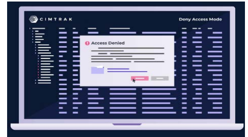
ADVANCED INTEGRITY MANAGEMENT SOFTWARE