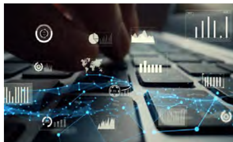
GLOBAL INTELLIGENCE SOLUTIONS