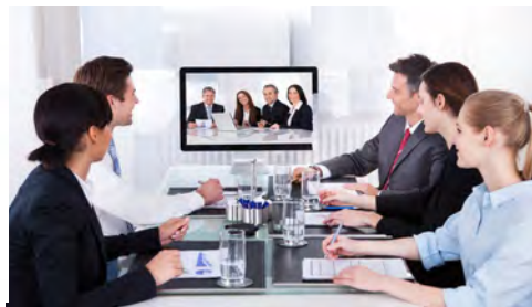
AUDIO & VIDEO CONFERENCING