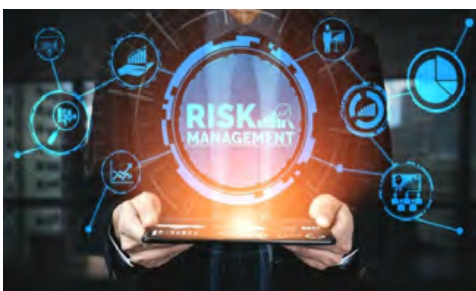
SUPPLIER RISK MANAGEMENT