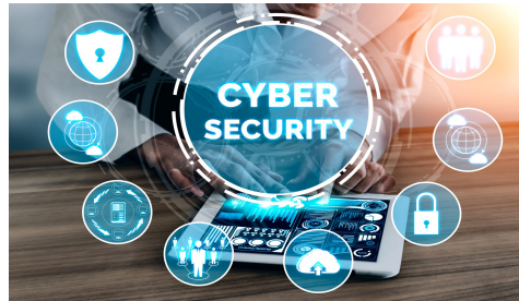
DARK WEB CYBERSECURITY SCANS