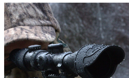
OPTICS AND FIREARM ACCESSORIES