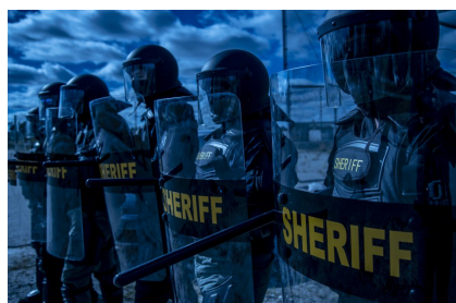
BODY ARMOUR AND PROTECTION