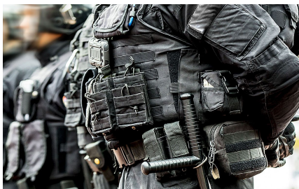
TACTICAL AND DUTY GEAR