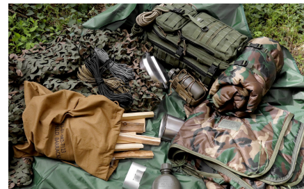
SURVIVAL AND OUTDOOR EQUIPMENT