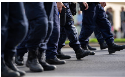
CLOTHING AND FOOTWEAR