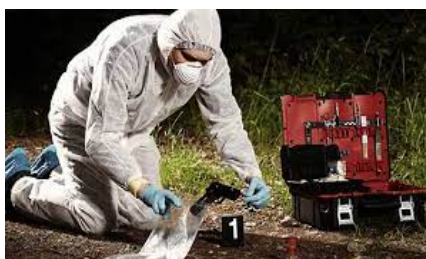
FORENSICS AND CIS EQUIPMENT