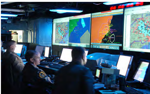
COMMAND & CONTROL