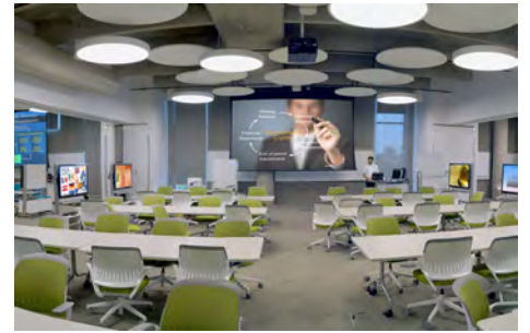
INTEGRATED TRAINING ROOMS